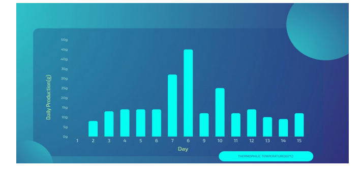
Figure 3: Average daily gas production at thermophilic temperature (60°C). Bar graph shows that the average daily biogas production is 17.57 grams, whereas the standard deviation is 9.31 grams.

By comparing the daily biogas production in the tire (Figure 2 and Figure 3), we can conclude that at thermophilic