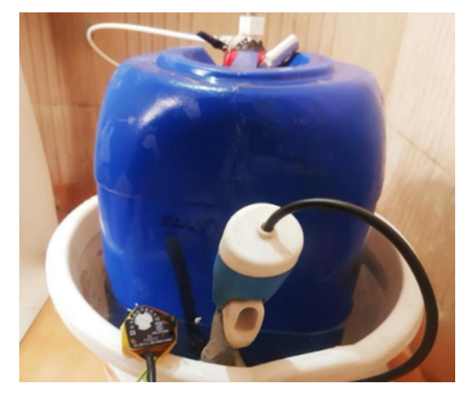
Figure 5: Waste digestion setup in a temperature-controlled water-bath. The digestion system is placed in a water bath maintaining a temperature of 60^{\circ} using a thermostat along with a 250 W heating rod.

This research helped us bolster our view of biogas production and its efficiency. It supported our hypothesis that a higher temperature would lead to a more significant breakdown of organic matter by bacteria in the absence of oxygen, boosting biogas production. From a broader perspective, this could lead to more effective waste management and could resolve the highly problematic issue of greenhouse gas emissions. Apart from the positive impact on the environment, higher gas production will also help increase the income of dairy farmers significantly and provide them with an alternative source of income for their livestock holdings. The decentralized system would in turn incentivize the agricultural workforce to become a part of this cyclic