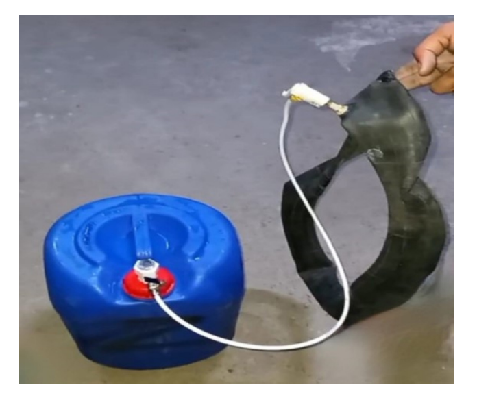
Figure 4: Digestion chamber attached with the gas collection tube. The gas collection tube is attached with the digestion chamber via an airtight pressure valve.

dung is bound to differ in that case, resulting in a variance in bacterial reaction to the anaerobic digestion's stimuli.