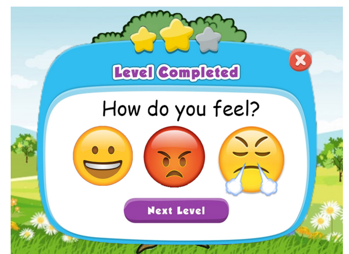
Figure 3. Emoji checker used throughout the app to check for Emotional Responsiveness.

51 In 2013, sensory reactivity or interest was added as a 52 symptom of ASD in the fifth edition of the DSM (15). In Autest, 53 we evaluate sensitivity to visual and auditory stimuli. Different 54 levels of the game have different color contrast schemes. 55 Behavioral responses to this change are quantified using the